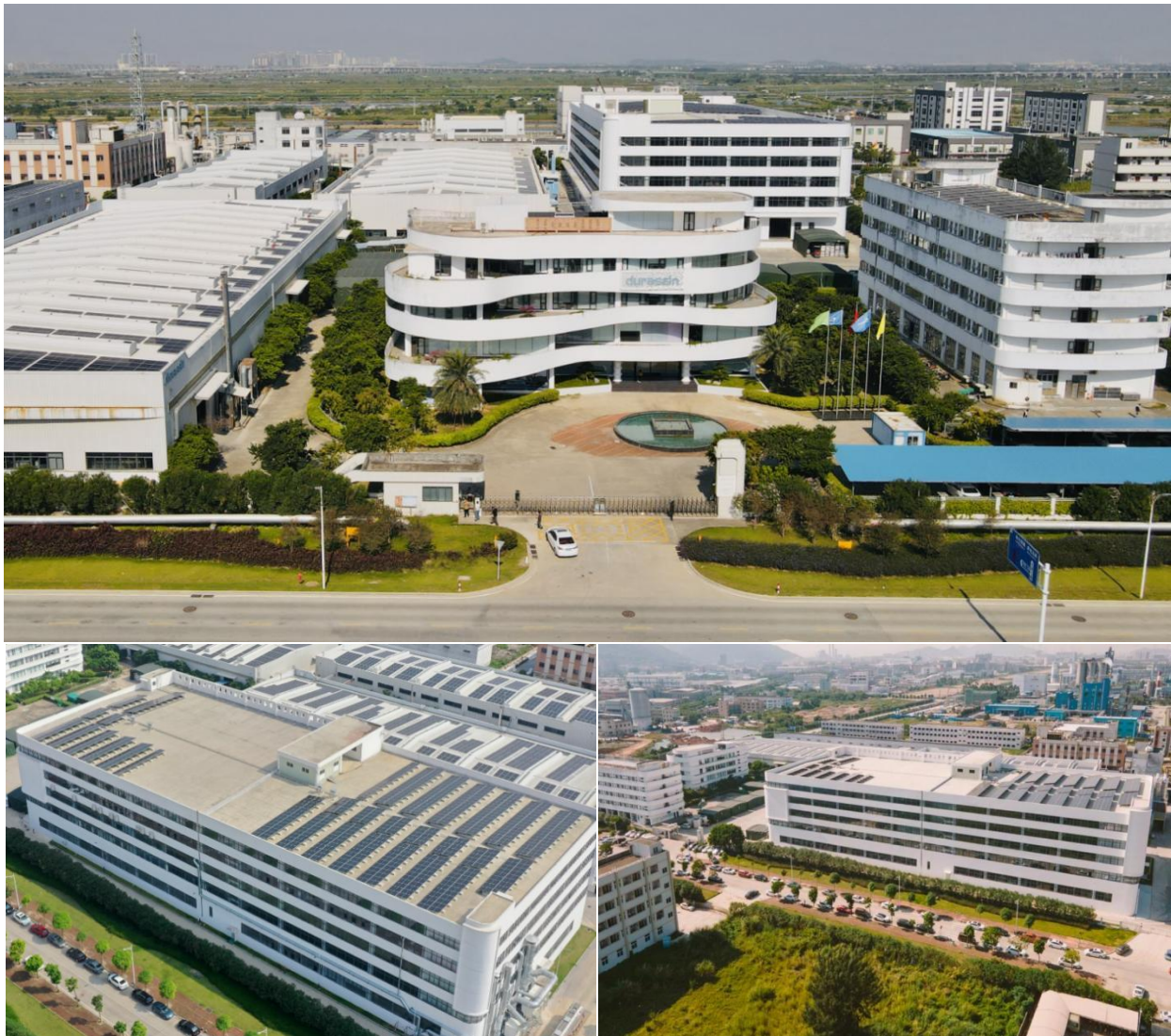
Pictures: factory building of Guangdong RELANG New Material Technology Co., Ltd.

Guangdong RELANG New Material Technology Co., Ltd. was established in 1999. At Guangdong RELANG New Material Technology Co., Ltd. we make industry leading Durasein® solid surface for people with big, bendy, twisty ideas. But we are really in the business of making the wildest creative dreams of designers come true. At Guangdong RELANG New Material Technology Co., Ltd., we know our material inside and out, providing exceptional support from R&D through production and installation- we help push and set the standard for Solid Surface. Our sheets and shapes have inspired some of the most prominent creative firms in the industry and have been fashioned by top-notch fabricators in more than 55 countries on 6 continents. We are here to help our customers achieve anything they can imagine. So go ahead and dream, and see what we can do for you.